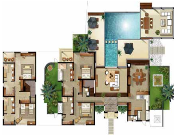
4 Bedroom Villa - 397 square metres