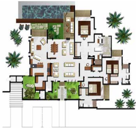
3 Bedroom Villa - 331 square metres