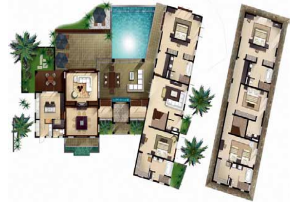
5 Bedroom Villa - 485 square metres