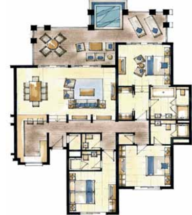
3 Bedroom Suite - 210-240 square metres