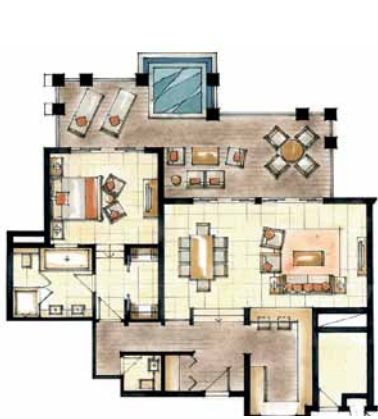
1 Bedroom Suite - 160 square metres