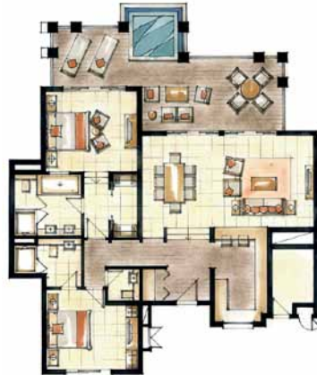
2 Bedroom Suite - 180-185 square metres