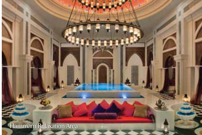
Hammam Relaxation Area

Talise Boutique | The Talise Boutique gives guests a chance to take home all the professional spa products used to create unique experiences at Talise Ottoman Spa. The boutique also offers a wide range of spa amenities such as candles, music and spa accessories.