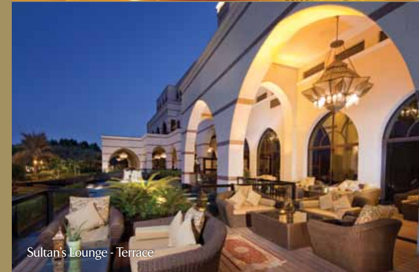
Sultan's Lounge - Terrace