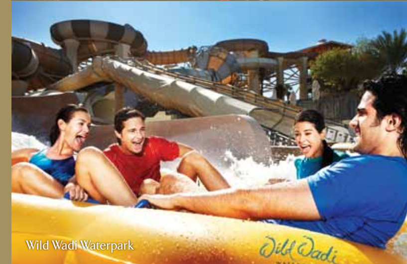
Wild Wadi Waterpark