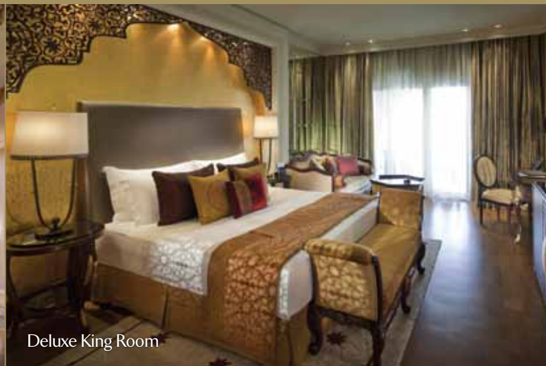
Deluxe King Room

Location | Situated on the West Crescent of Palm Jumeirah, Jumeirah Zabeel Saray is a mere 35-minute drive from Dubai International Airport and 45 minutes away from Abu Dhabi Airport.